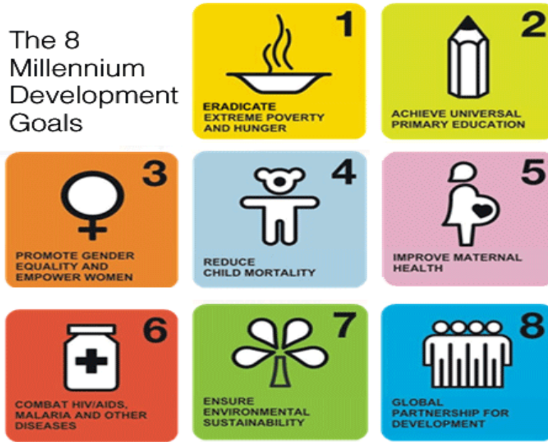
Figure 1 Millennium Development Goals

Previous researches highlighted that many places in Upper Egypt face pressing life conditions. There are unequal resources distribution in Upper Egypt comparing to Cairo and Delta. The poverty rate is the highest in Upper Egypt and specifically rural Upper Egypt (51.5 %), followed by urban Upper Egypt (29.4 %) and it is the least prevalent in Urban Governorates (9.6 %); the same applies to the poverty gap and the squared poverty gap (CAPMAS 2011).